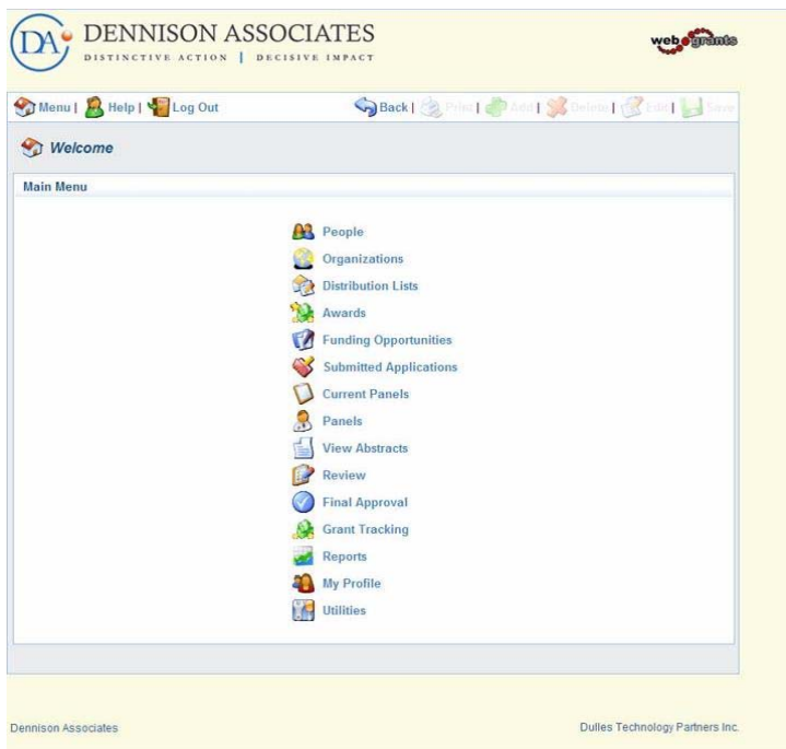
HUD grantee main menu